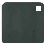
RUBIO MONOCOAT GREEN