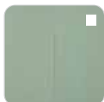
SALT LAKE GREEN